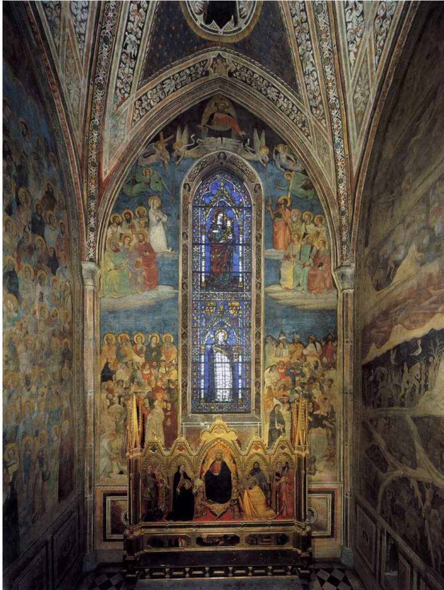
Figure 2: Capella Strozzi (Strozzi Chapel), Santa Maria Novella (Right) – Inferno (“Hell”) fresco, Nardo di Cione

“imagebank” 1005 x1334; http://chnm.gmu.edu/courses/ffolliott/arth340/imagebank/strozz0.jpg